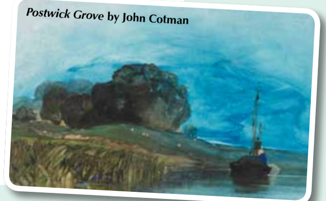
Postwick Grove by John Cotman

Described as "an utterly ravishing exhibition", showcasing a "grand sweep of watercolour painting that few other museums can rival", the Fitzwilliam's latest show is a stunner. Including masterworks by Blake, Turner and Cezanne – some of which haven't been seen for decades – Watercolour: Elements of Nature runs until the end of September and admission is free. So that's your Rainy Day Plan sorted. (Soz to be the bearers of bad news, but skies are set to be grey (again) this weekend...) ● fitzmuseum.cam.ac.uk